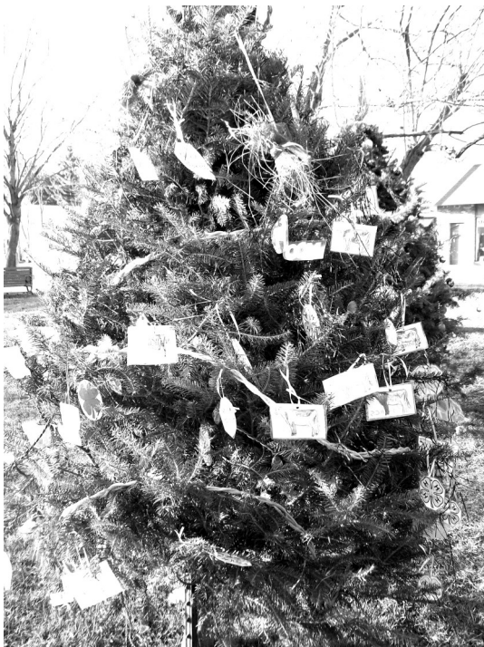
Milkin' Maniacs decorated a tree for the Festival of Trees in Cobleskill.